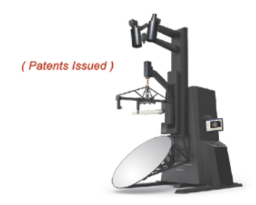
GO-R5000 Full-Field Speed Goniophotometer