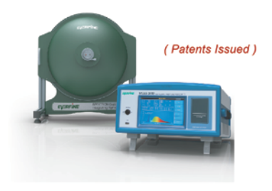
HAAS-3000 High Accuracy Array Spectroradiometer